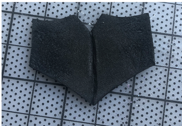
Bevelled cut on underside of top Crest