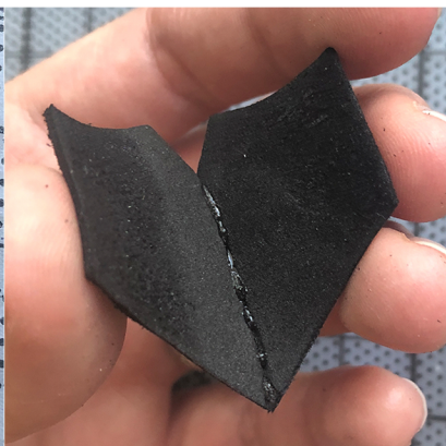
Glue and pinch bevel