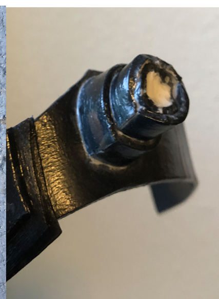
Broken Horn with rings and Quickseal texture