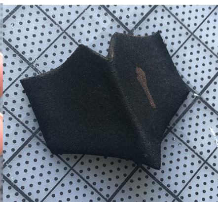
Result on top