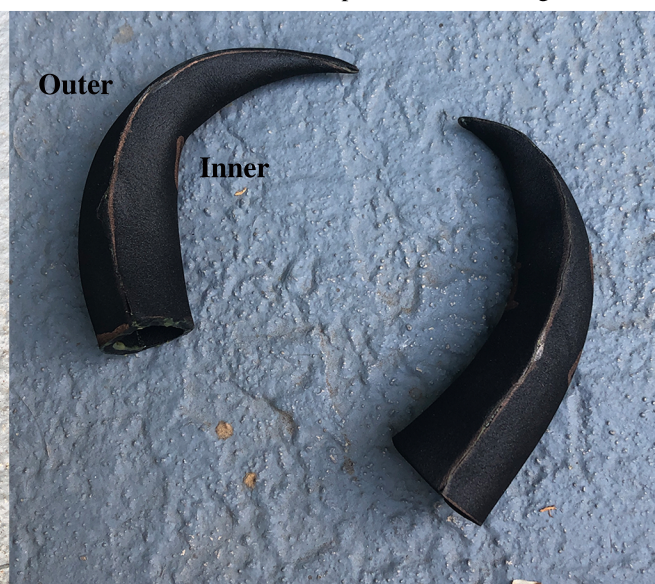
Horns after glueing