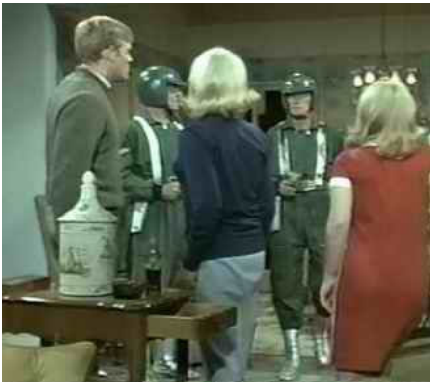
TWO FUTURE CYBORGS ARMED WITH HAMILTON PISTOLS