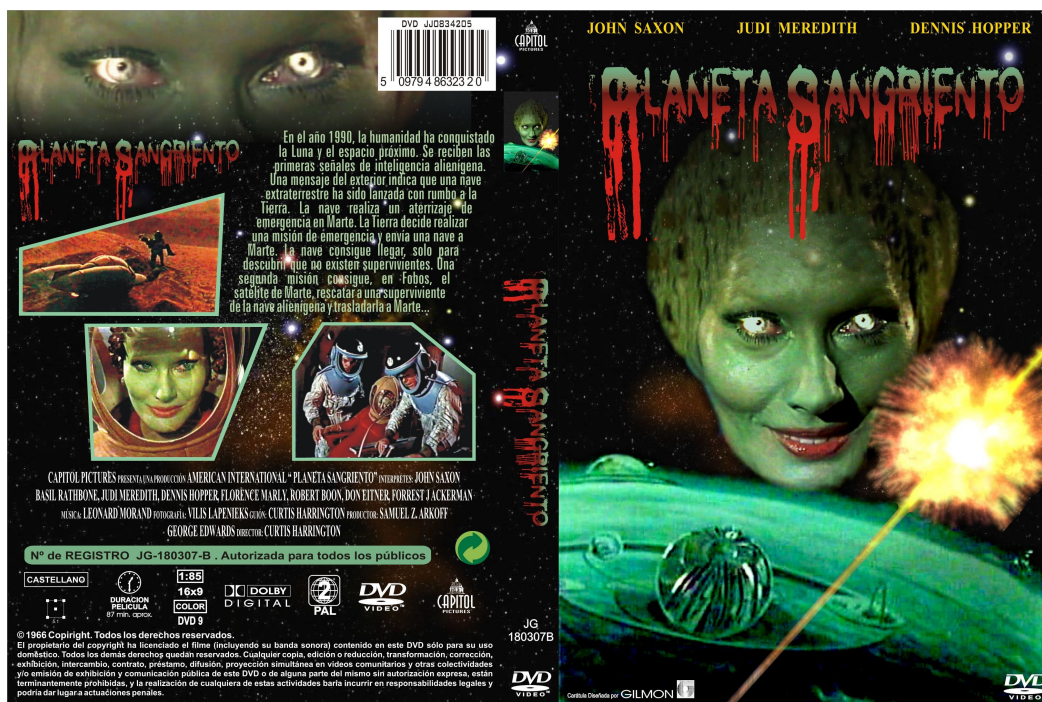
QUEEN OF BLOOD 1966