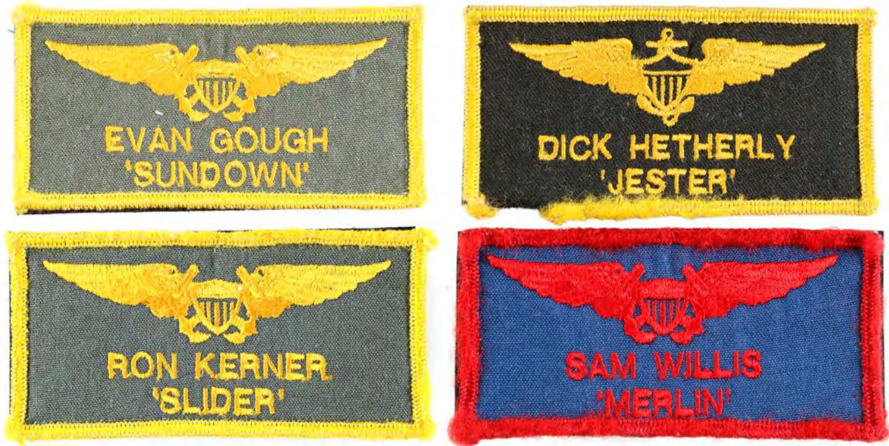
812. Merlin (Tim Robbins), Jester (Michael Ironside), Slider (Rick Rossovich) and Sundown’s (Clarence Gilyard Jr.) Flight Suit Patches Δ

Merlin (Tim Robbins), Jester (Michael Ironside), Slider (Rick Rossovich) and Sundown’s (Clarence Gilyard Jr.) flight suit patches from Tony Scott’s action drama Top Gun. Radio intercept officers Sam “Merlin” Willis, Ron “Slider” Kerner and Evan “Sundown” Gough wore their flight suits with ID patches while training at the Naval Air Station Miramar’s elite “Top Gun” fighter program under the instruction of their commanding officer, Dick “Jester” Hetherly.